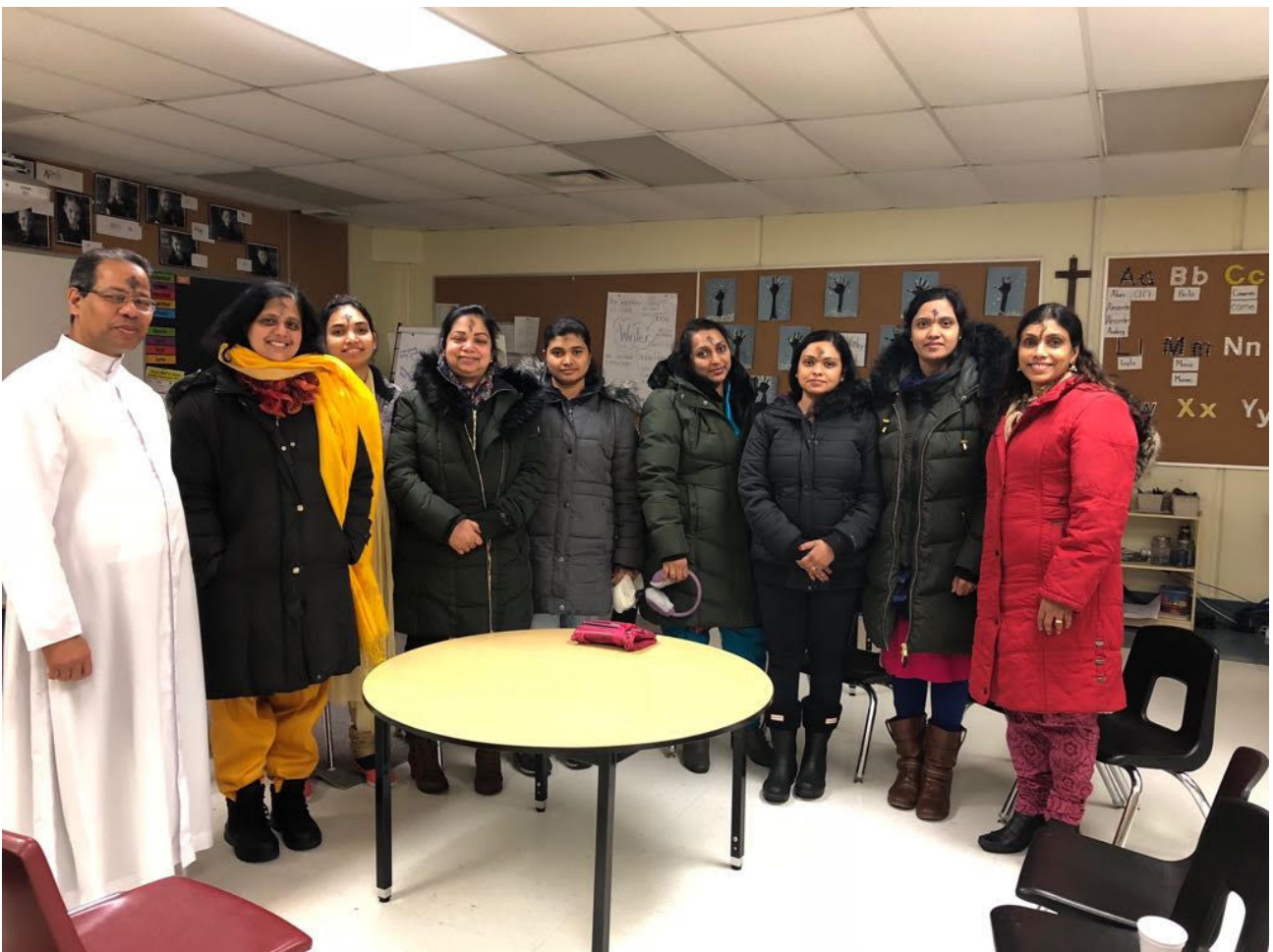
An ordinary meeting of the Nurses' Ministry was held on Sunday, February 11, after the Holy Qurbana, with prayer, sharing and discussions.